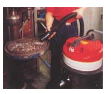
Industrial strength machine for heavy duty applications.