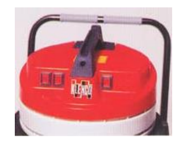
3 motors for maximum suction power.